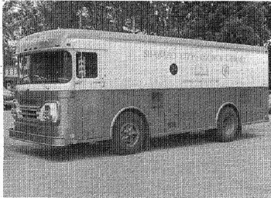
Shawano County Library Mobile.