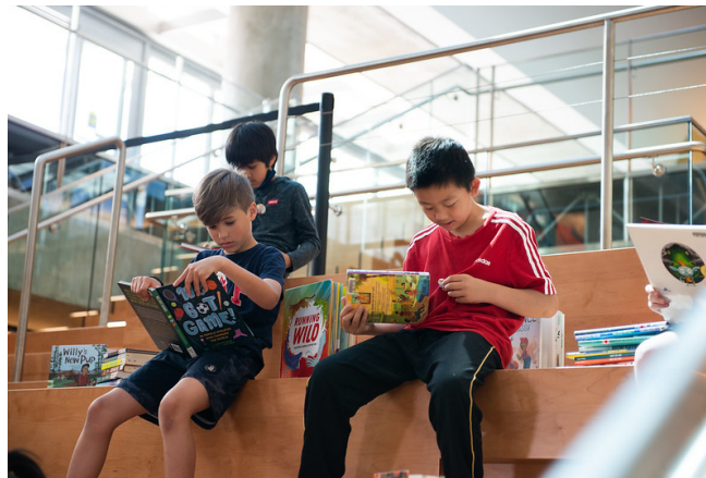
Summer Reading Club

WebJunction with members of the 2022-2024 ALSC Research Committee / 26 March 2024